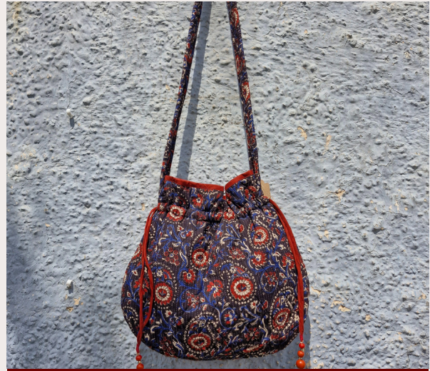
QUILTED POTLI BAGS