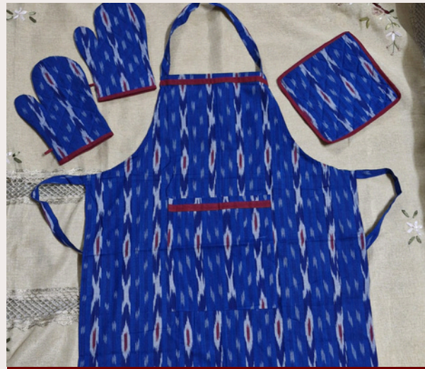
APRON & HEAT RESISTANT GLOVES WITH PLACE MAT