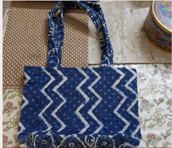
MINI TOTE BAGS