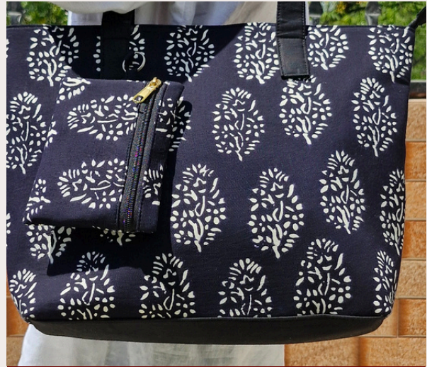
STYLISH SHOULDER BAGS