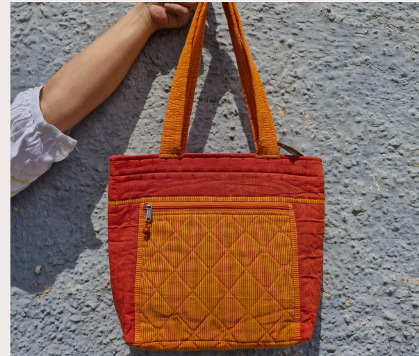
QUILTED ZIPPED TOTE BAGS