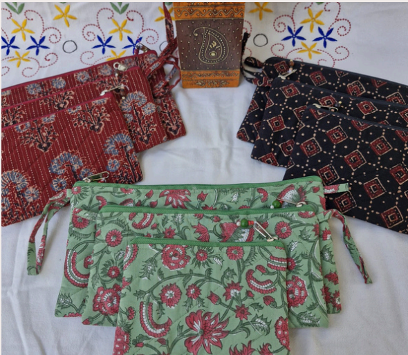
MULTI PURPOSE POUCHES