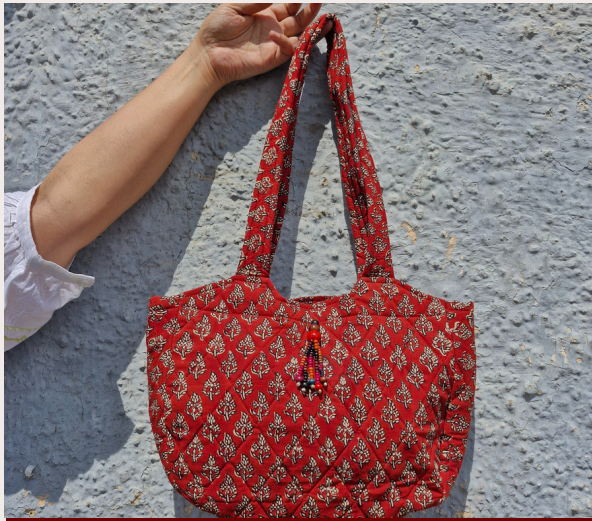
QUILTED BOAT TOTE BAGS