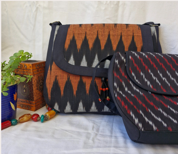
IKKAT SLING BAGS