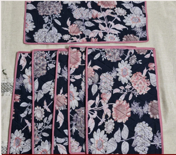
QUILTED TABLE MATS SET OF 6+1