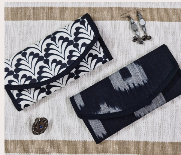
MULTI PURPOSE WALLETS